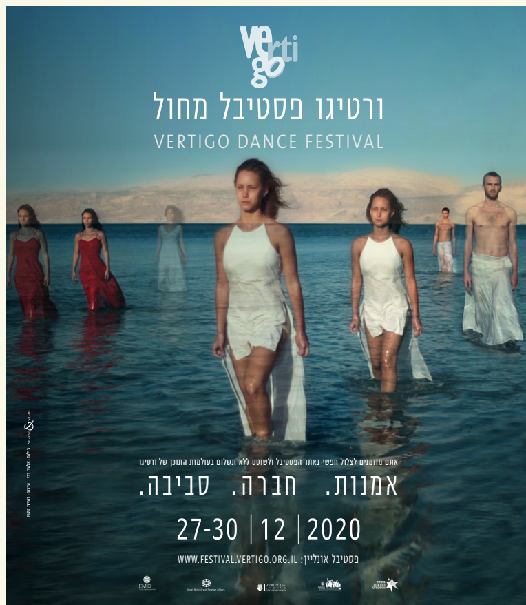
Vertigo Dance Festival

With the end of the COVID-19 pandemic in Israel, our organization has now resumed in-person activities and expect to continue offering performances and other activities in Israel's periphery, for the benefit of the disadvantaged sectors that would otherwise not be able to witness our performances.