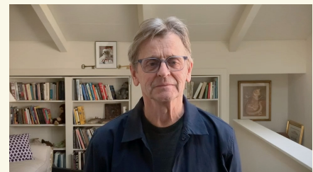
Barishnikov greeting Vertigo's Festival