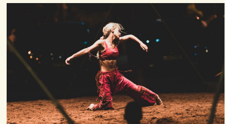
Birth of the Phoenix